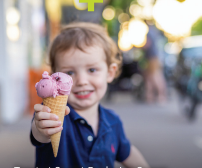
Treat at Sweet Peaks Ice Cream