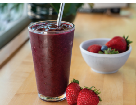
Radiate Smoothie, Green Source