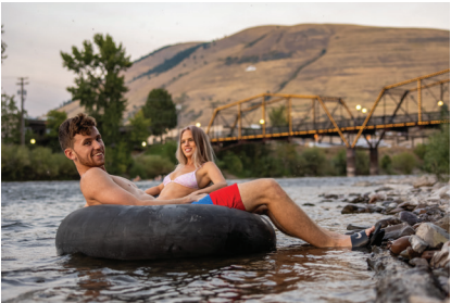
Float the Clark Fork River