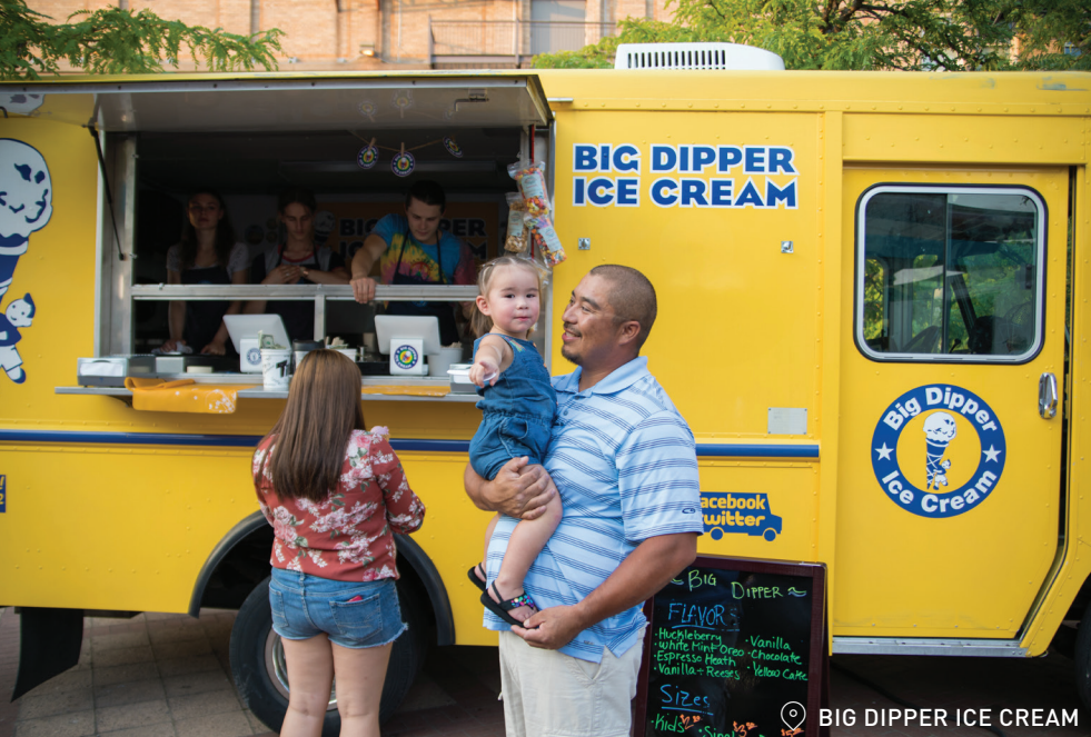
BIG DIPPER ICE CREAM