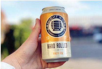
Hand Rolled Hazy IPA from Draught Works