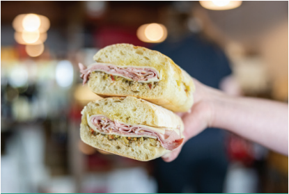
The Clash sandwich from Tagliare Delicatessen