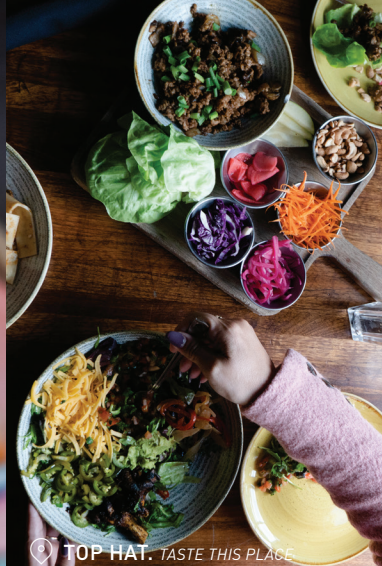
📍 TOP HAT. TASTE THIS PLACE