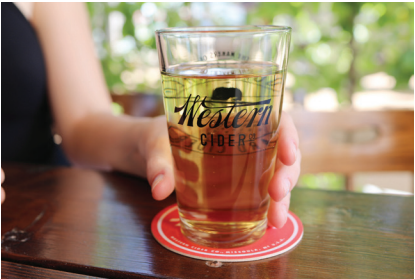
Farmhouse Cider from Western Cider