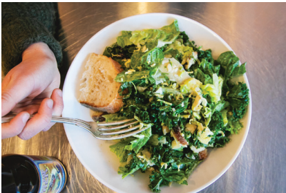
Brussels Sprouts Caesar Salad from Basal