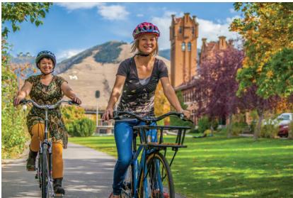
Bike ride along the Riverfront Trail