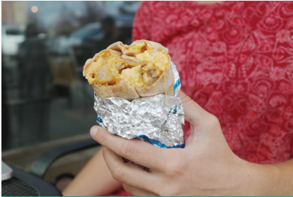
Breakfast burrito from Market on Front