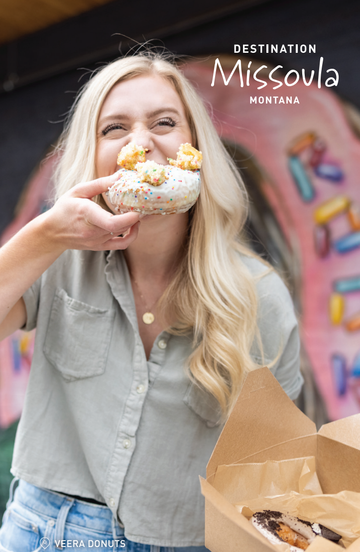
📍 VEERA DONUTS