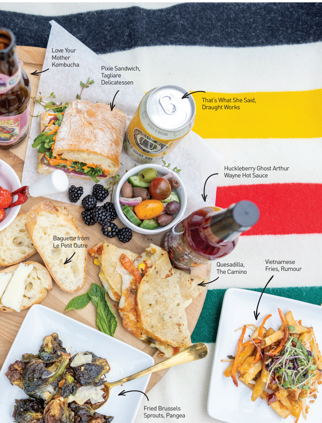
Love Your Mother Kombucha