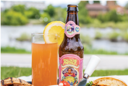
Back to the Mother Kombucha