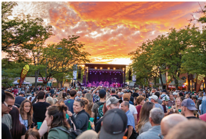
Catch an outdoor concert