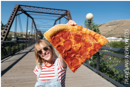
Daily Slice from Bridge Pizza