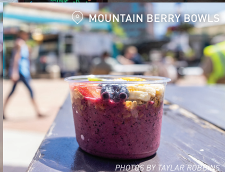
MOUNTAIN BERRY BOWLS